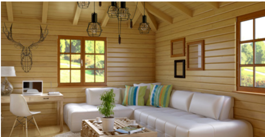
E.g. for the production of tongue and groove joints which are commonly used for ceiling and wall claddings. Tipped profile cutters from Leitz are ideal.